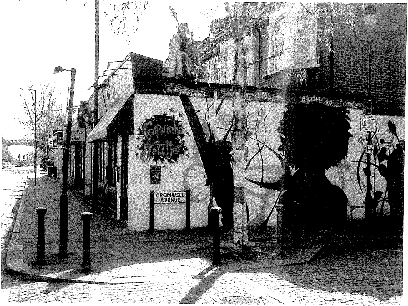
Corner of premises at Cromwell Avenue and Archway road.