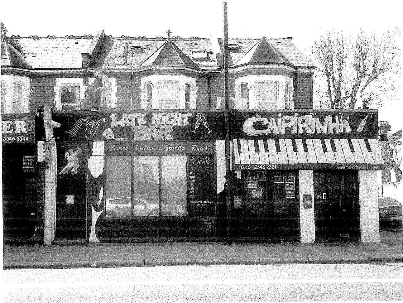
Frontage of premises facing Archway Road. Please note the residential properties above the Bar.